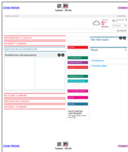
Page cleaned by NewsWasher